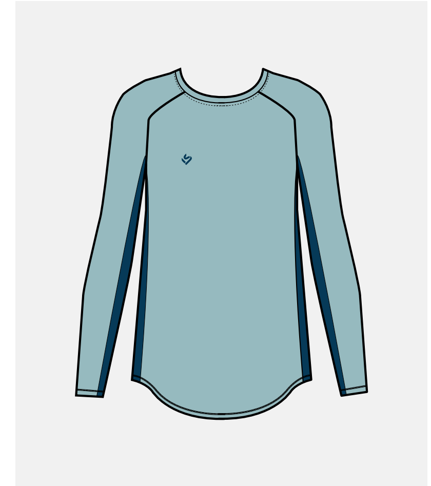
Long Sleeved TShirt