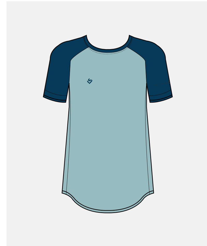
Short Sleeved TShirt